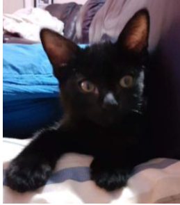
Felix our new kitten

My son recently wanted a cat. We had been wanting a kitten for a long time and decided it was finally time to get one. We heard about a free kitten from a friend that needed a new home. We went to meet him and it was love at first sight. From his big green eyes to the extra large un-proportioned paws, my youngest son was smitten and loved everything about him.